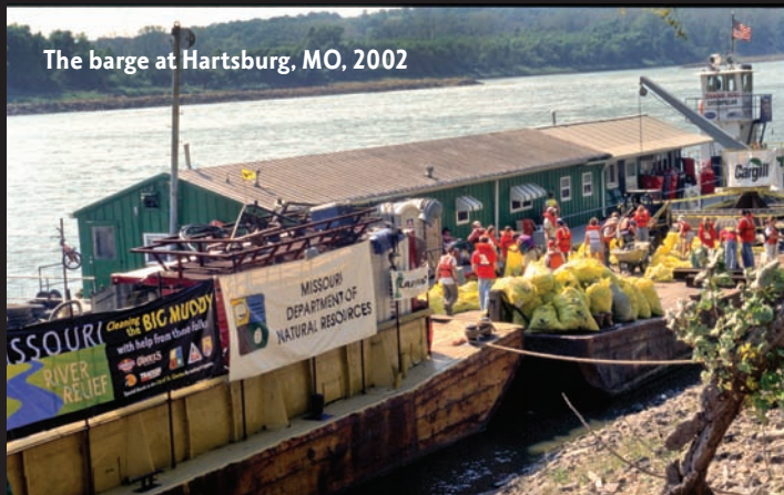
The barge at Hartsburg, MO, 2002