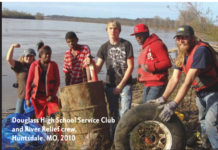
Douglass High School Service Club and River Relief crew, Huntsdale, MO, 2010