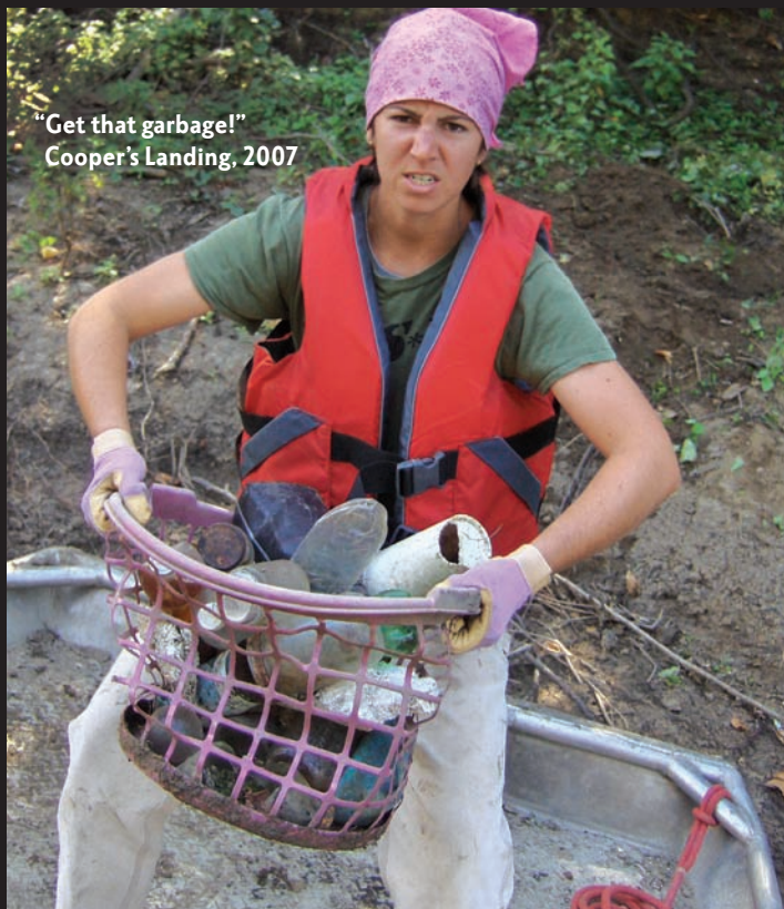
"Get that garbage!" Cooper's Landing, 2007

Celebrating Accomplishments • Building Partnerships • Taking Action